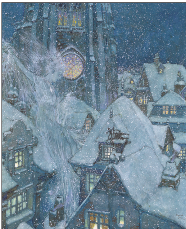
The Snow Queen, Edmund Dulac